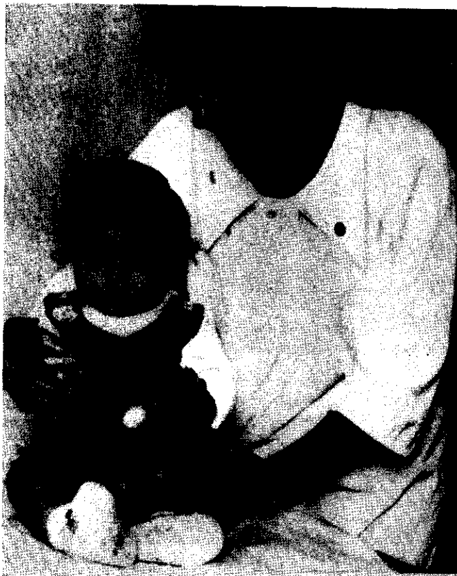
During the grape strike in California, the author volunteered to help provide health care for strikers and their families. She went for a month and remained for five years.

tember 1965 in Delano, a small town situated in the southern part of one of the world's richest agricultural areas, California's San Joaquin Valley. Filipino members of the Agricultural Workers Organizing Committee, AFL-CIO, walked out of the grape vineyards demanding a 10-cent-an-hour increase in wages from $1.10 to $1.20 and the right to have a union. They were joined by the National Farm Workers Association led by Cesar Chavez and the grape strike was on. After five years of strike and boycott, the United Farm Workers, AFL-CIO (the two groups merged in 1966), signed contracts with over 90 percent of the area grape growers. The union now has many other contracts in California, Arizona, and Florida.