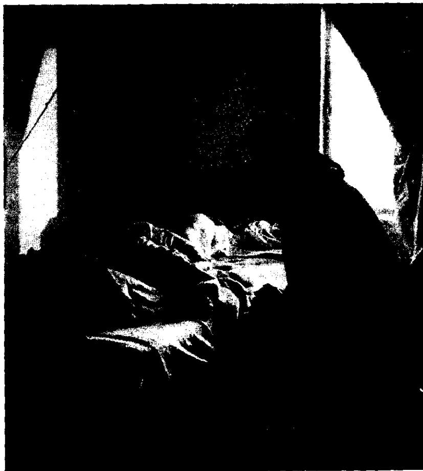
The author made hundreds of home visits to farm workers in the Delano area and got to know them and their special problems.

The first ban on DDT in California was in a farm worker contract three years before the statewide ban